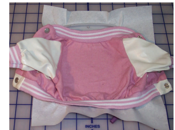
Place jacket on the sticky stabilizer using placement marks.

I like to use the gridlines on my cutting mat to help me determine the placement of my designs and blanks. I line up the center points with the marks on my hoop.