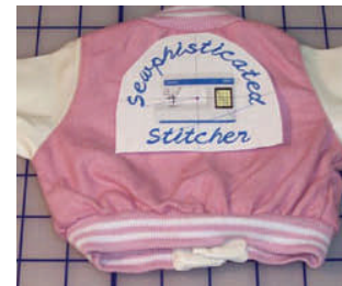
Determine placement of design with template

The hoopless method of embroidery will work best for embroidering your jacket as it is too small to hoop. Use your favorite type of sticky tearaway stabilizer. You will be hooping the jacket 3 times. Feel free to "patch" your stabilizer to get the most usage from it.