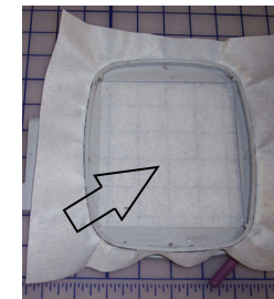
Determine center point of hoop using grid from cutting mat.