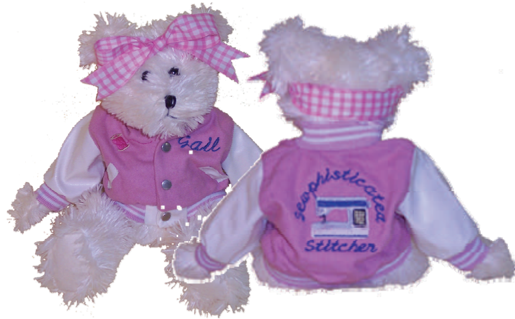
Cream William Bear with personalized sewing theme varsity jacket